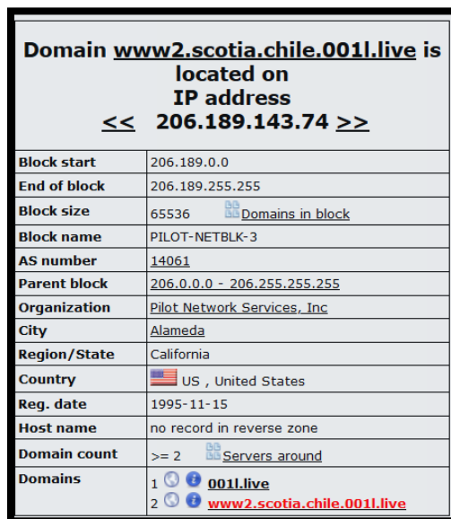
Ilustración 3 Ip de Origen donde se aloja Sitio Falso del Banco Scotiabank